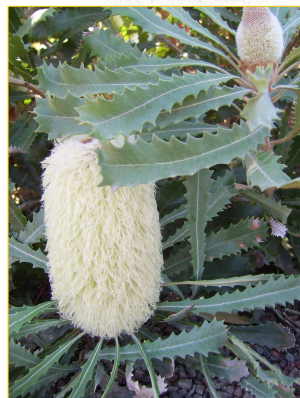
Banksia baueri Possum Banksia