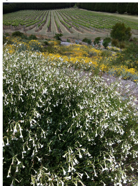
Nicotiana suaveolens , Austral tobacco

Until next time, I wish you all a most joyous and productive month in your garden.