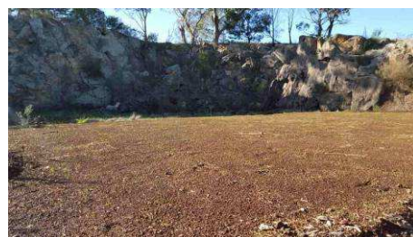
Newly seeded native lawn.

Some food for thought, and until next time, cheers and 'Happy Gardening'!