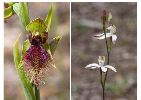
Calochilus robertsonii Purple Beard-orchid