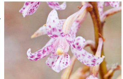
Dipodium pardalinum Spotted Hyacinth-orchid