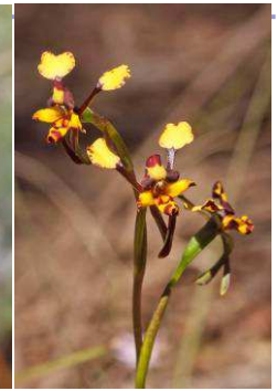
Diuris pardina Leopard Orchid