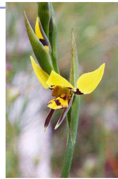
Diuris sulphurea Tiger Orchid

More of Paul's photos and products can be found at www.piko.com.au/photography