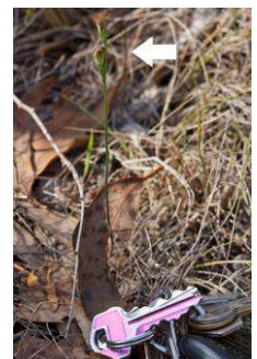
Pterostylis parviflora sp.2 - Tiny Greenhood