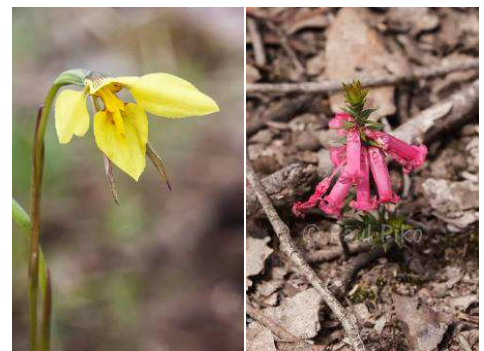
Diuris chryseopsis Golden Moths