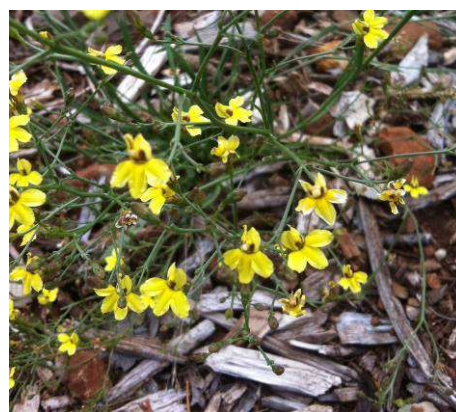
Goodenia gracilis - Slender Goodenia