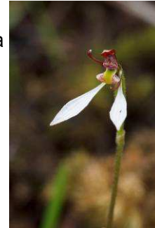
Eriochilus cucullatus Parson's Bands