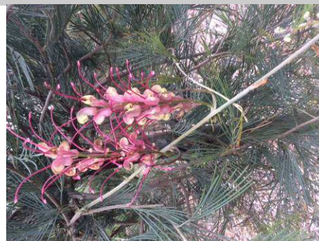
Grevillea plurijuga short-lobe form

It will survive frosts to at least -6 . Is best grafted onto G. robusta in Melbourne.