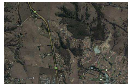
Wallan/Hidden Valley Google maps satellite image

Dolomite Rise is located in the heights of the North Western sector of Hidden Valley. The remnant bushland takes in hills and gullies which provide for a range of different micro-climates: In the woodland areas the trees are dense enough so that there is less understorey, and different plant species grow on the slopes rather than in the damper, moister gullies. Gum and Box trees are growing on the slopes with a dry understorey and little Orchids. The gullies stay greener, with more moisture, so understorey plants such as Cassinia, Ozothamnus and quite a few species of Orchid grow in these sites.