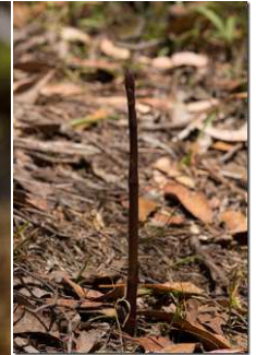
Dipodium species, Probably a D. roseum –Rosy Hyacinth-orchid