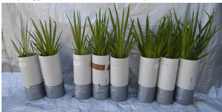
Visual response of Anigozanthos flavidus 'Landscape Lilac': Left to Right, Control, 1 kg/m 3 and 3 kg/m 3 of Bush Tucker