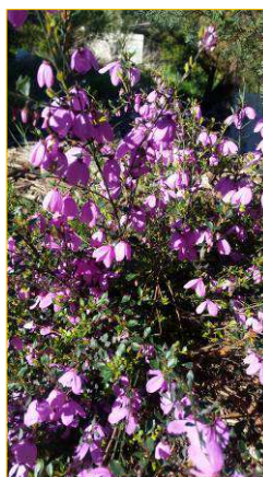
Tetratheca ciliata - Pink Bells