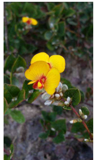
Taken in the Cobaw Forest 7.10.2017. Can anyone ID this Pea Flower please?