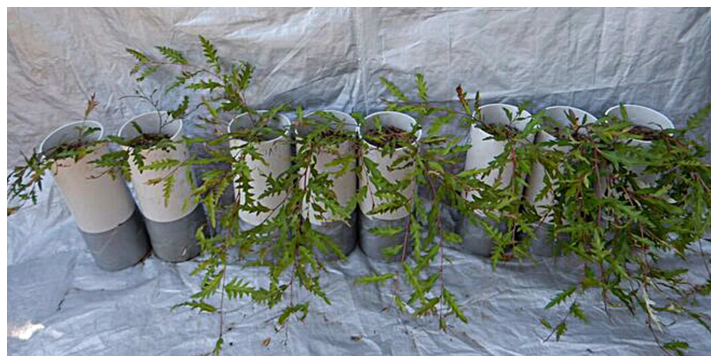
Visual response of Grevillea Poorinda 'Royal Mantle': Left to Right, Control, 1 kg/m 3 and 3 kg/m 3 of Bush Tucker