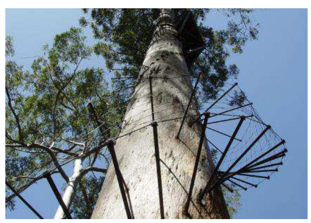
Gloucester Tree Pemberton WA