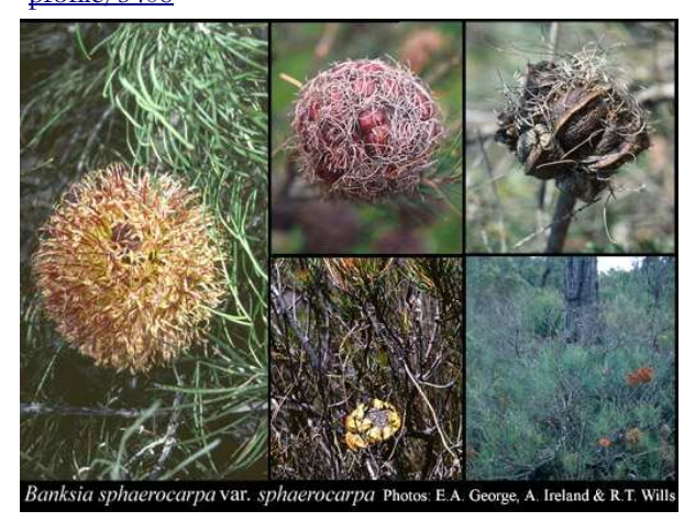
Image: <a href="https://florabase.dpaw.wa.gov.au/browse/">https://florabase.dpaw.wa.gov.au/browse/</a> profile/3408