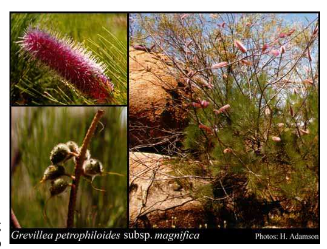
Grevillea petrophiloides subsp. magnifica