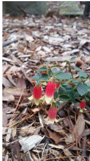
Correa Canberra Bell