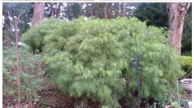
Acacia cognata