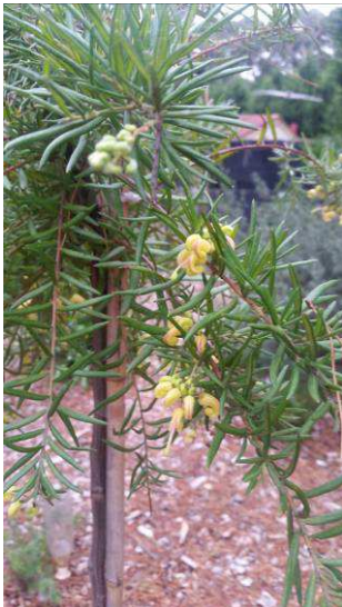
Grevillea Lemon Daze