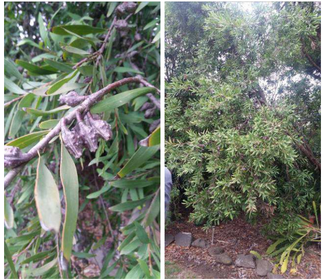
Hakea salicifolia Left: Woody fruits Right: Form