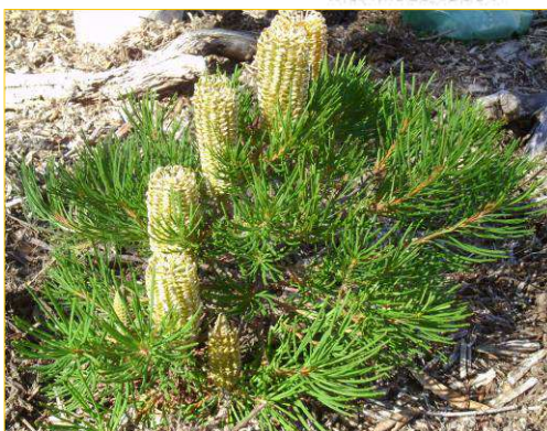
Banksia spinulosa (dwarf form) - Hairpin Banksia

Our June edition will be issued on or close to the second Monday (June 12th).