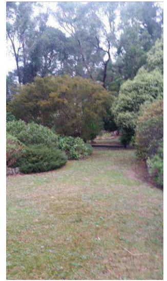
Above & Below: Garden views & shared afternoon tea