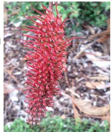
Grevillea dryandroides subsp. hirsuta

Ph: 0438 270 248 Email: ianjulian@bigpond.com.au