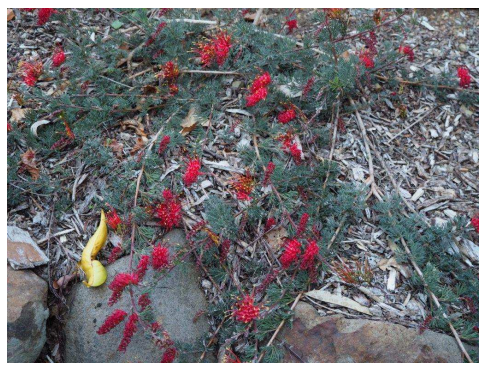
Grevillea humifusa