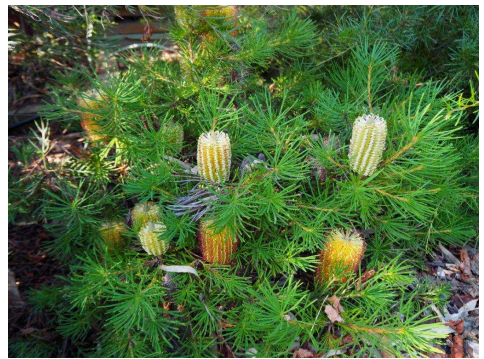
Wahlenbergia communis

Banksia Birthday Candles' (B. Spinulosa form)