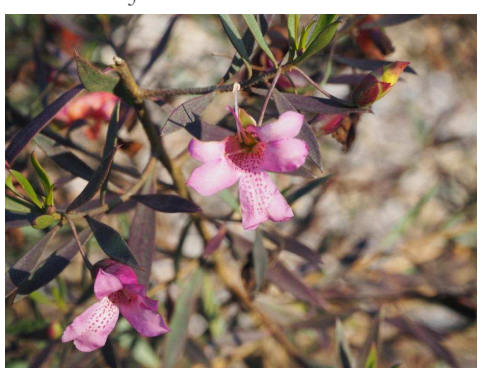
Eremophila sp.