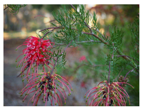
Grevillea fililoba

Themeda triandra Kangaroo Grass Isotoma axillaris Rock Isotome Myoporum parvifolium Creeping Boobialla Pelargonium australe Banksia "Birthday Candles" (a B. spinulosa dwarf form) Crowea sp. Grevillea lanigera Wooly Bush, Mt Tamworth Grevillea thyrsoides Eremophila glabra (Yellow form) Grevillea fililoba Grevillea "Rosy Posy" Hakea decurrens Prostanthera magnifica (has been flowering for 9 months) Chrysosephalum semipapposum Clustered Everlasting Microlaena stipoides Weeping Grass Eremophila sp. Hakea "Burrendong Beauty" Correa glabra Grevillea semperflorens - A Grevillea which was bred in England Eremophila granitica Grevillea maccutcheonii Grevillea "Ned Kellv" Grevillea Obtusifolia (form) Scaevola sp. Goodenia ovata Grevillea humifusa prostrate form – Growing in a sheltered spot Acacia podalyriifolia Mt Morgan Wattle - A Queensland Wattle Eucalyptus leucoxylon Yellow Gum Pterostylis sp. Greenhoods - Just budding up Acacia acinacea Gold Dust Wattle - Flowering out of season Acacia sp. (a fine leaved non-local)