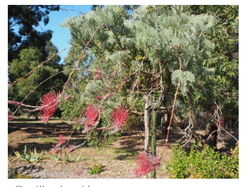
Grevillea thyrsoides

Banksia Birthday Candles' (B. Spinulosa form)