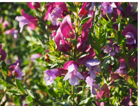
Prostanthera magnifica