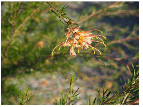
Grevillea semperflorens