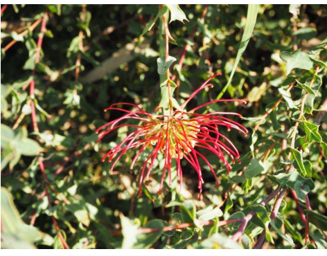
Grevillea maccutcheonii