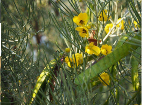
Senna artemisioides