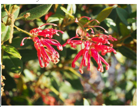
Grevillea victoriae