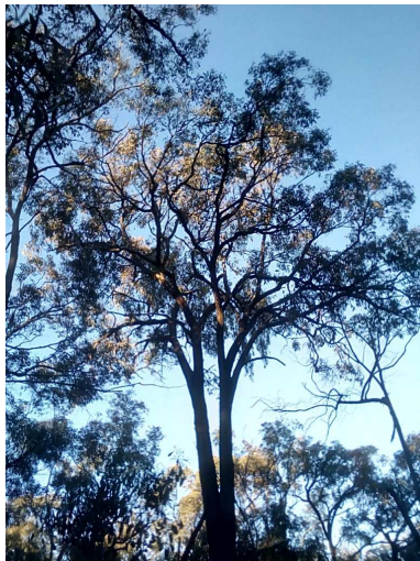
Eucalyptus tricarpa - These are tall trees with an open crown.