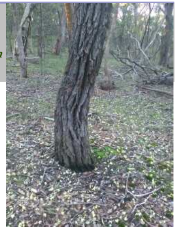
Eucalyptus tricarpa , Tall tree in flower now, damaged flowers at base of tree following bird activity.