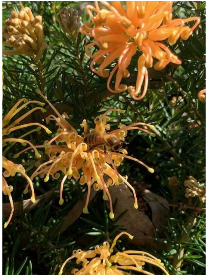
Grevillea juniperina "Molonglo"