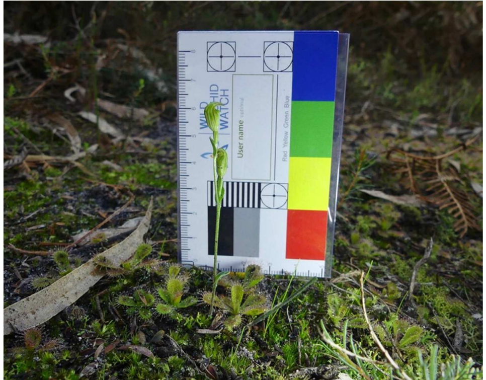
Pterostylis parviflora - Frankston, Vic

We have a new print run of WOW scale cards. If you would like a couple for yourself or a bundle to give out to nature photographers in your organisation (e.g. Landcare or "Friends of" groups), please send us your postal address and we will mail them to you. info@wildorchidwatch.org