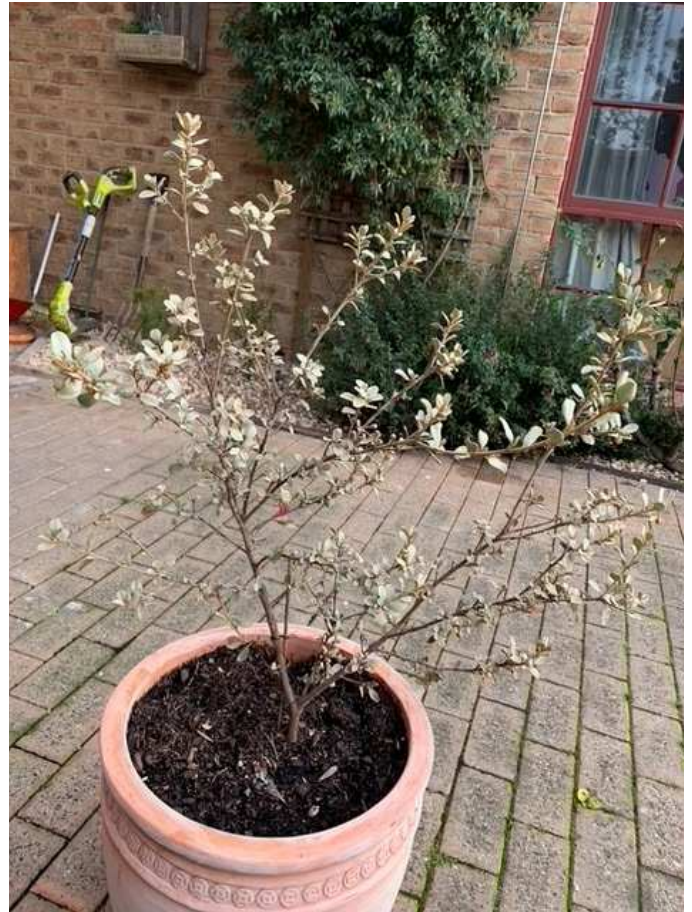
Above: Diplolaena mollis (grafted). Below right: Alyogyne hakeifolia Below left: Lysiosepalum involucrellum

Lysiosepalum involucrellum (below left) is closely related to Thomasia , and forms a compact shrub growing to 1m. It occurs naturally in southern and south-eastern areas of WA. Pinkish to mauve flowers occur en masse in late winter and spring. Requiring a well drained site in full sun to part shade. It will also do well in a large pot.