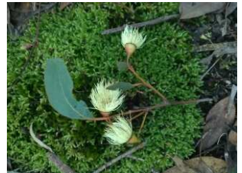
Eucalyptus tricarpa , fallen flowers at base of tall tree. Large, creamy white flowers on long, thin pedicels. Note grey green foliage.