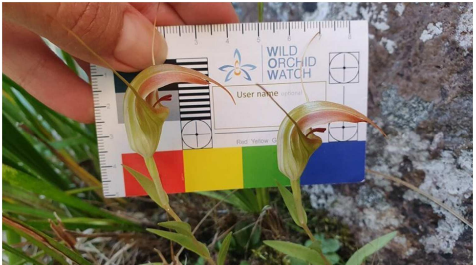
Pterostylis pulchella - Budderoo National Park, NSW