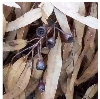
Eucalyptus tricarpa , fruit are large, barrel shaped, with valves below disc level. Buds (not illustrated) are conical, with a slightly curved tip, no scar at join of cap. This is very similar to some varieties of E. leucoxydon .