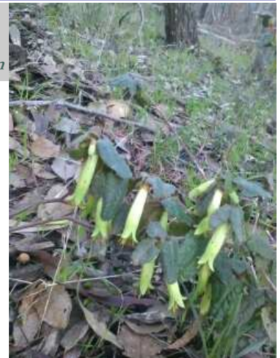
Correa reflexa Local green from at Mt. Piper Reserve July 2020.

MEETINGS ARE HELD ON THE 3rd MONDAY OF THE MONTH (February to November) unless otherwise advised