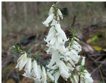
Epacris impressa at Mt Charlie Flora Reserve 26/6/20

The August newsletter will be due for issue on or within a few days of Monday August 10th. I'll be eagerly looking forward to hearing from our members & friends again. So please, please, send contributions in by Monday August 3rd.