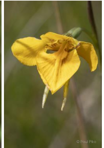
Diuris behrii Golden Cowslip (above & above left with spider)