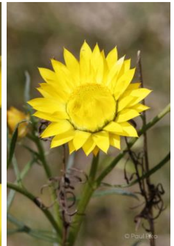
Xerochrysum viscosum Sticky Everlasting