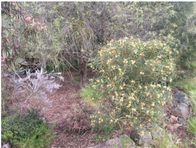
Above, below & below right: Views from Janis Baker's garden