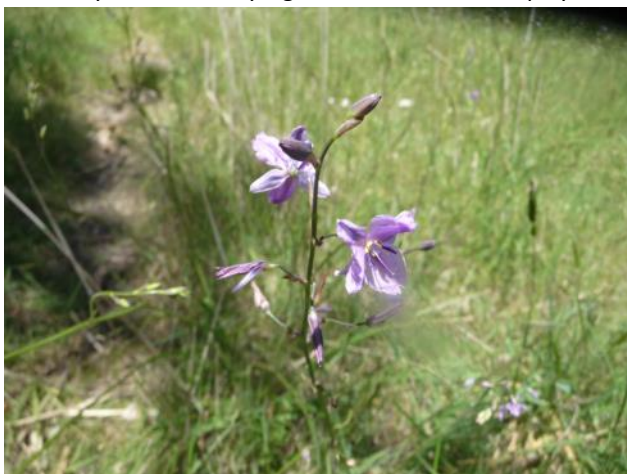
Arthropodium strictum - Chocolate Lily growing at Bill & Bee Barker's