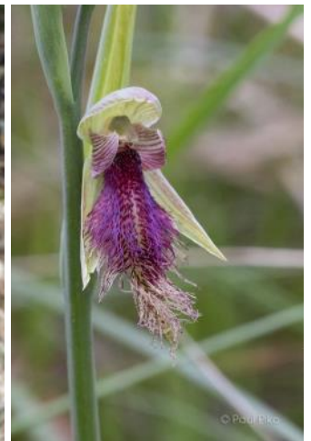
Calochilus robertsonii (Continued on page 7)