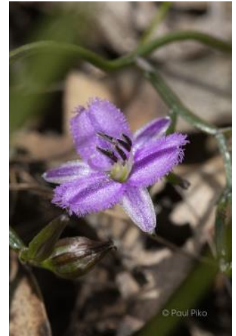
Thysanotus patersonii - Twining Fringe-lily