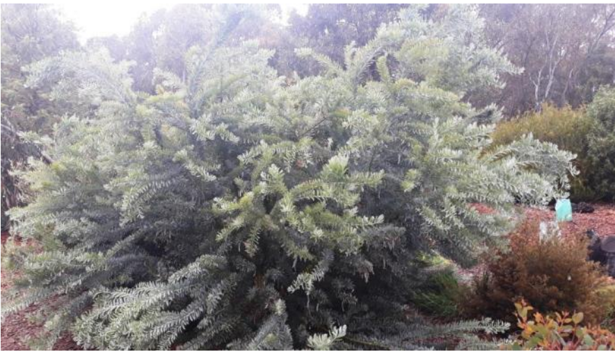
Above: Acacia convenyi form.

Is a unique and spectacular shrub with distinctive foliage. It is also one of the greyest wattles. The large, yellow, ball-like flowers are vibrant against blue grey narrow oblong leaves. It is very hardy, drought tolerant, makes a useful screen, and is unique for foliage and flower colour contrast.