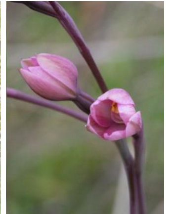
Thelymitra rubra . Salmon Sun-orchid buds opening.