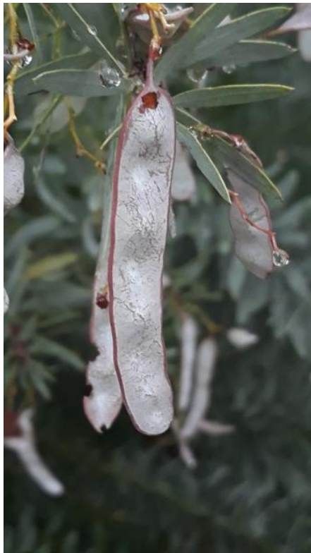
Left & far left: Acacia convenyi seed pods.