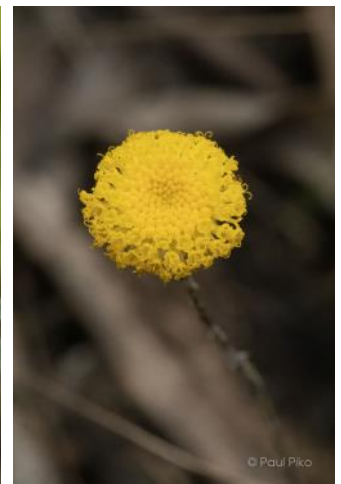
Leptorhynchus sp.