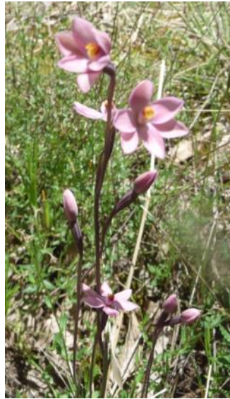
Thelymitra rubra . Salmon Sun-orchid

Last but not least, a few views from Janis Baker's garden: