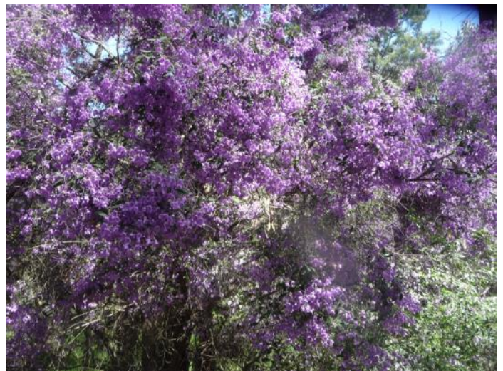
Prostanthera ovalifolia