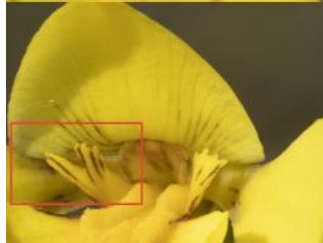
Diuris behrii (above) & Diuris chryseopsis (below)