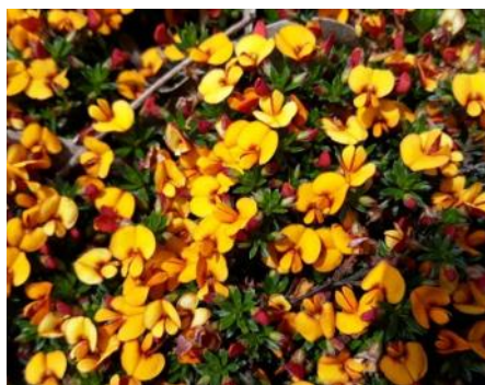
Pultenaea pedunculata Matted Bush-pea 19.10.21

Once again I extend heartfelt thanks to everyone who has supported our group and this newsletter through another challenging year. Your assistance has been invaluable.