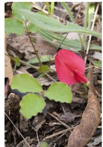
Kennedia prostrata Running Postman (Continued on page 6)