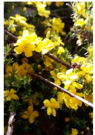
Hibbertia exaltata 7.11.21

The presentations will be followed by the evening Door Prize plant raffle, flower specimen table discussion - bring something along from your garden to show & please remember to label your plants with the species name if known. The evening will conclude with time for supper & chat.