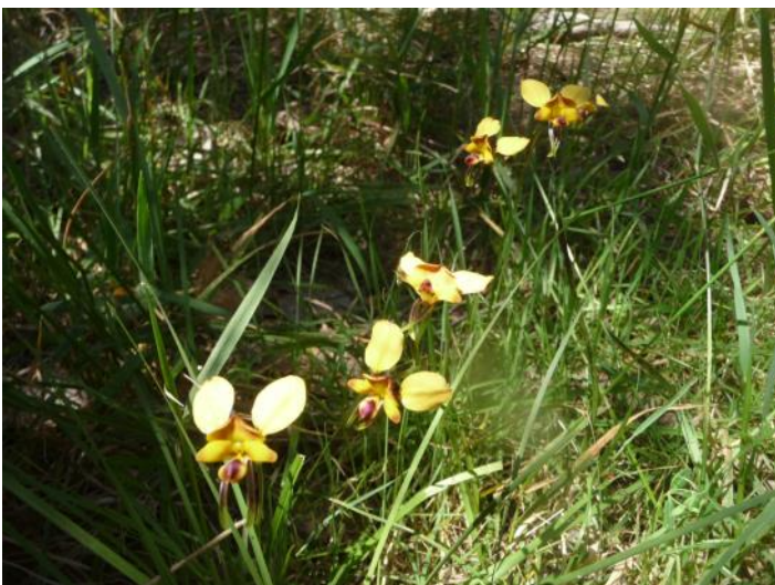
Diuris orientis Wallflower Orchid