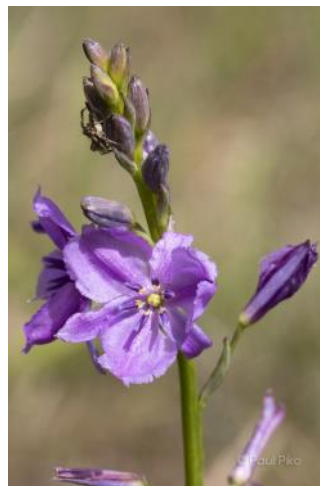
Arthropodium strictum - Chocolate Lily