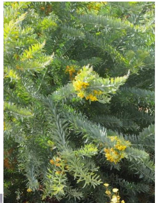
Above: Acacia convenyi in flower.