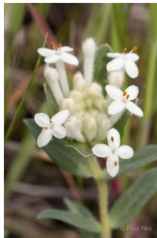
Pimelea humilis . - Common Rice-flower or Small Rice-flower.