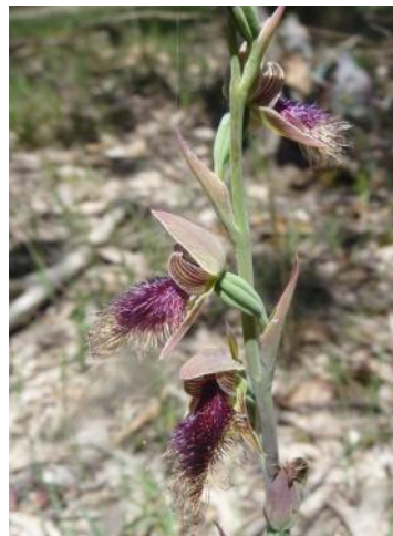
Calochilus robertsonii Purplish Beard-orchid