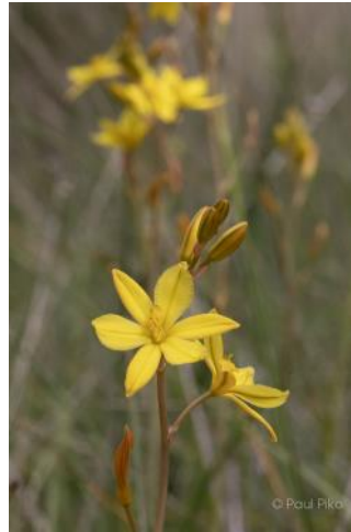
Bulbine bulbosa . - Bulbine Lily

Arthropodium strictum Chocolate Lily is a perennial lily in the Asparagaceae family. Narrow, flat leaves of 1-10mm wide grow to 10-60cm. Flowering stems can grow to 1.2m high and produce mauve to purple, chocolate scented flowers from October to December. Suited to well drained soils in a full sun to semi-shaded site. They make a lovely sight when in a mass display.