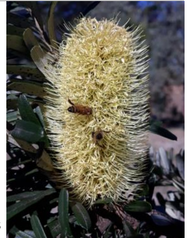
Banksia Marginata