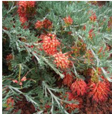
Grevillea preissii subsp. glabrilimba