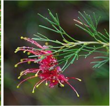
Grevillea preissii subsp. preissii