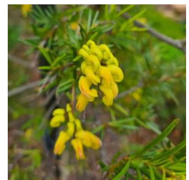
Grevillea 'Lemon Daze'