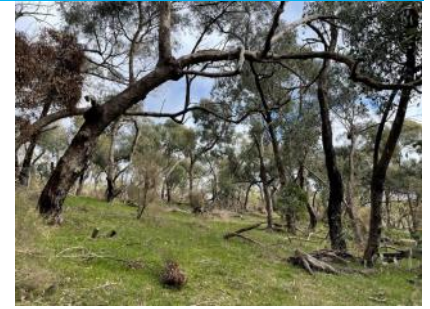
Grassy open forest, Monument Hill.

These activities are open to APS Mitchell members, and I encourage you to participate. They will be announced in upcoming APS Mitchell newsletters.