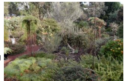
Weir garden July 2018.