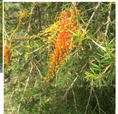
Grevillea tenuiloba