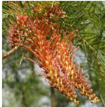
Grevillea 'Thorny Devil'