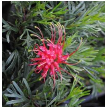
Grevillea thelemanniana "Green Gem"

Grevillea 'Lemon Daze' forms a moderately dense shrub to 1-1.5m high x 1m wide and has Rosemary-like leaves of soft, greyish-green with sharp tips. Yellow & pink flowers hang in clusters, from autumn to spring and make good cut flowers. It is a hardy, bird-attracting plant with nectar rich flowers, that was bred by Bywong Nursery, and is a Grevillea lanigera x rosmarinifolia . Tolerating a range of soil types, cold to sub-tropical and coastal conditions, it does best in a sunny position in well-drained soil. Although it will cope with some part shade, and is frost and