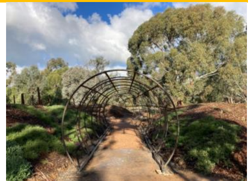
Climate Ready Garden at Euroa Arboretum.

Register your interest and preferences by emailing: g4w@apsmitchell.org.au