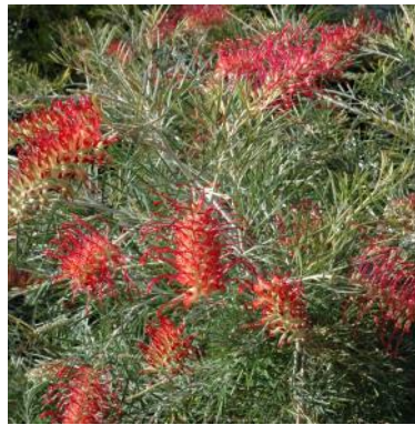
Grevillea 'Spirit of Anzac'

Grevillea 'Lara Dwarf' is a selected, naturally occurring form of G. rosmarinifolia that is found east of Lara, near Melbourne. It forms a compact, prostrate shrub growing to 0.30m high x 1m wide. Masses of cream and pinkish red spider flowers occur April to October. A hardy plant that is tolerant of heavy soils, is drought resistant, and prefers a full to part sun site.