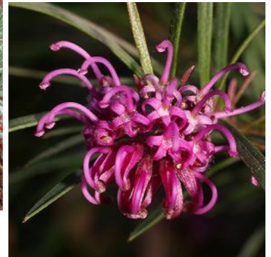
Above: Grevillea sericea subsp. riparia