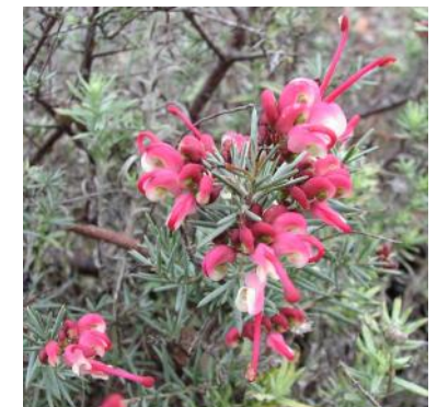
Grevillea Lara 'Dwarf' Photo: By Melburnian - Self-photographed, CC BY 3.0, https://commons.wikimedia.org/w/index.php?curid=10641864

https://commons.wikimedia.org/wiki/Grevillea_cultivars