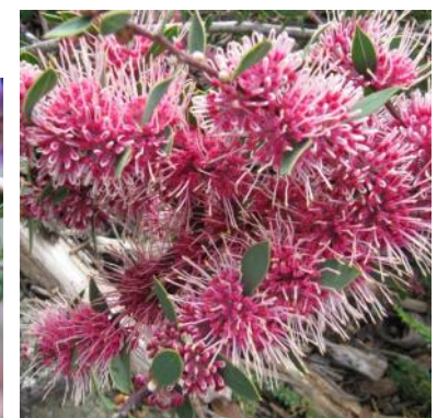
Hakea Burrendong Beauty