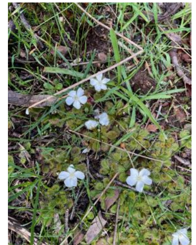
Drosera aberrans (Scented Sundew) among Arthropodium strictum (Chocolate Lily)

[7] https://theconversation.com/why-communities-must-be-at-the-heart-of-conserving-wildlife-plants-and-ecosystems-132416