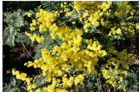
Acacia dealbata 06/08/22

Once again, thank you to everyone who contributes to our newsletter & supports APS