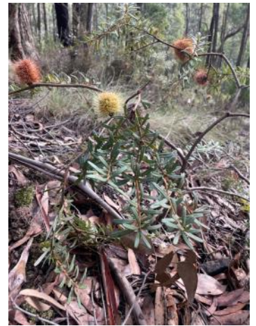
An increasingly rare sight: Banksia marginata sapling in Blackwood, July 2022.

Banksia marginata is available in many indigenous nurseries. Given its wide distribution, it is preferable to plant locally-adapted stock — check with your nursery on provenance, requirements, and form — tree growth to 12 m is possible; on smaller plots, a dwarf form may be more suitable.