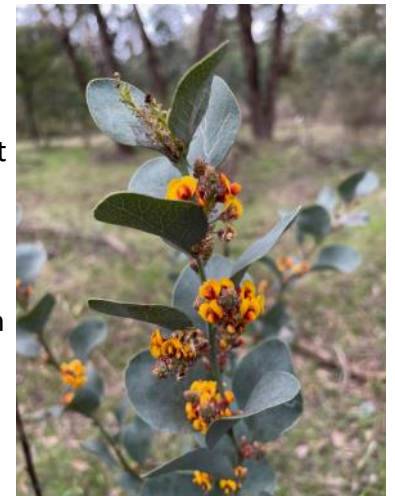
Daviesia latifolia

If you have any suggestion how we can improve G4W, please let me know by emailing at g4w@apsmitchell.org.au .