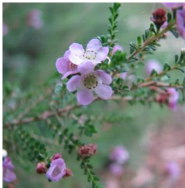
Thryptomene baeckeacea