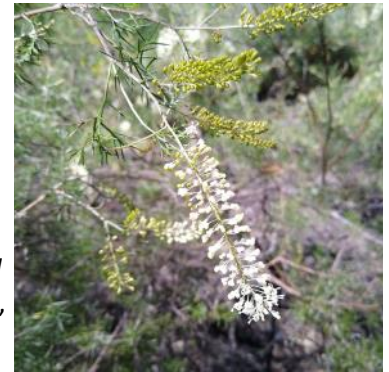
Grevillea subtiliflora

Do come along if you can. See details on page 2.