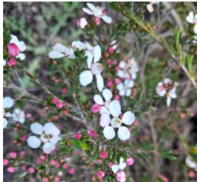
Possibly a Baeckea sp.