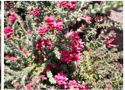
Grevillea chance garden seedling.