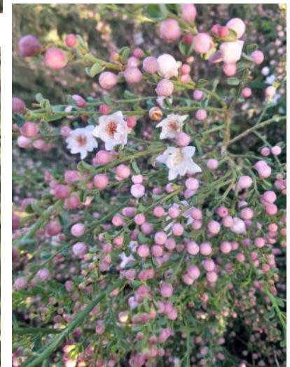
Philotheca verrucosa double flowered form.