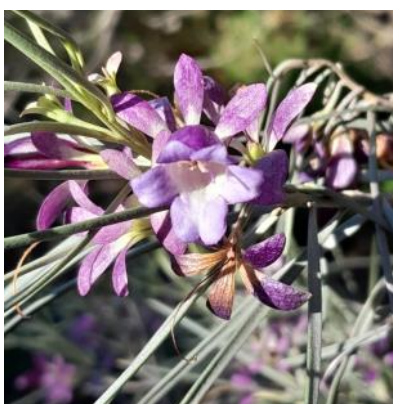
Eremophila oppositifolia subsp. oppositifolia 'Ray's Blue'.