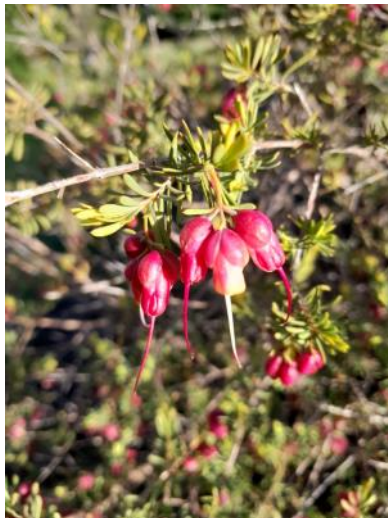
Possibly Homoranthus porteri