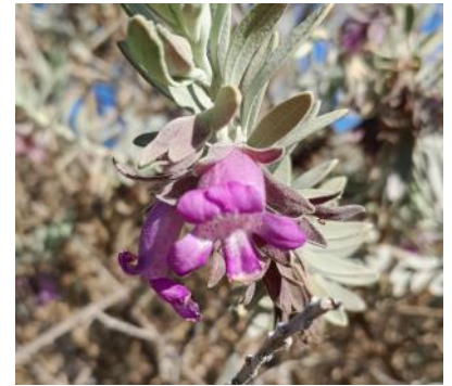
Eremophila compacta subsp. compacta