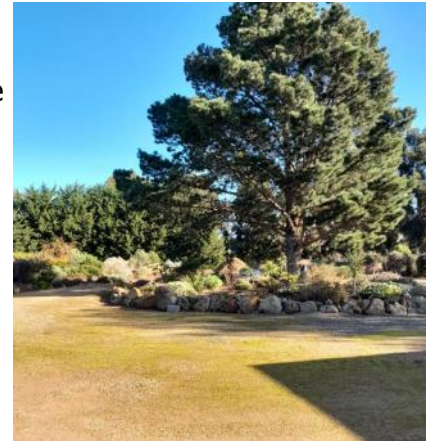
View of driveway garden bed at "Eremophila Park".

Eremophila platycalyx is a quite a variable species with a