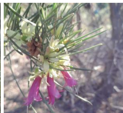
Eremophila oppositifolia subsp. oppositifolia