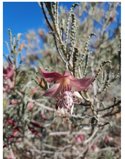
Eremophila mirabilis