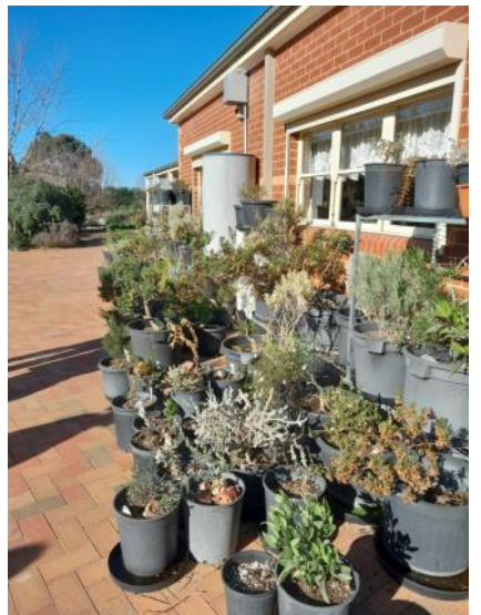
Russell's potted collection.