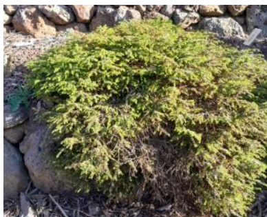
Eremophila barbata prostrate form in garden.