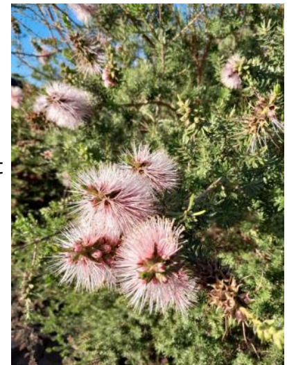
Kunzea baxteri pink form