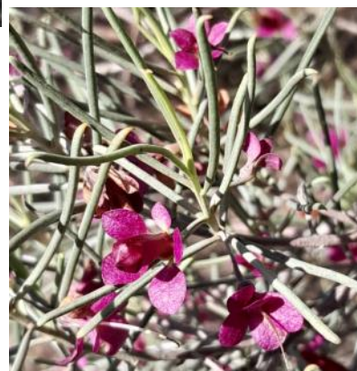
Eremophila oppositifolia subsp. angustifolia