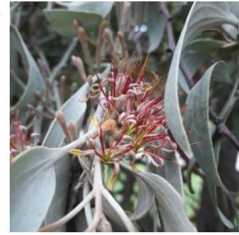
Amyema quandang Grey Mistletoe

For further Covid Safe information see Covid safe facility plan.