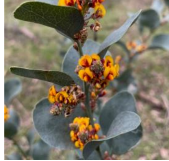
Daviesia latifolia on Monument Hill Kilmore.