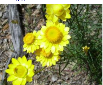
Xerochrysum viscosum