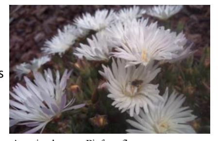
A native bee on Pigface flowers.