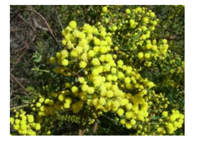
Acacia acinacea Tallarook form