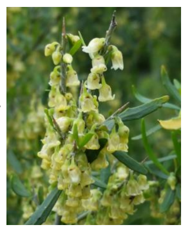
Melicytus dentatus