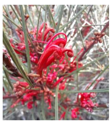
Grevillea dimorpha fine leaf form

Grevillea curviloba 'Flat Jack' is a named prostrate form that grows 0.50m high x 2m