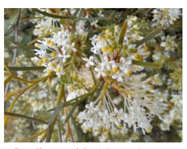
Grevillea curviloba 'Flat Jack'

Chamelaucium uncinatum Geraldton Wax is a widely grown species that is native to the west coast of WA, and is often used in the floristry trade. It forms a shrub growing in the range of 1.2-3m high x 1.5-4m wide and has fine, soft, needle-like foliage with hooked tips. There are both coastal and inland forms, the coastal form can have bigger foliage than the inland form. A number of cultivars and dwarf forms are available. Waxy, five petalled flowers of up to a 2.5cm diameter with almost round petals occur in profusion during winter and spring. Flower colour ranges from white into pinks, with colour often deepening with age. Some cultivars have purple-