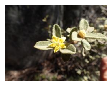
Asteriscophora subsp. Andre Messina CC BY-NC-SA 4.0 https://vicflora.rbg.vic.gov.au/flora/ /taxon/63365f02-b3be-434c-b11122c1538d4698#&gid=1&pid=11