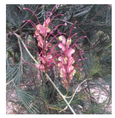
Grevillea plurijuga short lobe form