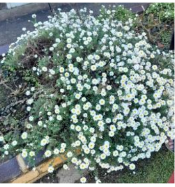
Rhodanthe anthemoides