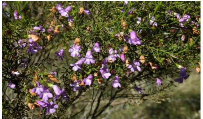
Eremophila drummondii