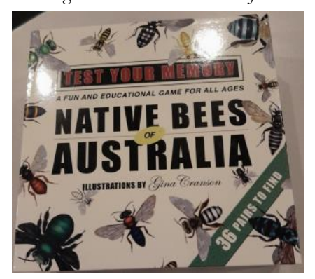
Native Bees of Australia Game