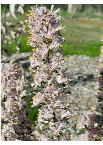
Petrophile biloba

Philotheca myoporoides Long-leaf Wax-flower is one of Australia's most widely known and grown species that has up to ten subspecies (four in Victoria). It is endemic to the east coast ranging from Victoria, through NSW, up into south east QLD. A hardy fast growing dense shrub reaching 2m that has glandular to warty, aromatic foliage, and bears a profusion of pollinator attracting pink-white flowers in spring. It prefers a