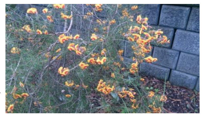
Dillwynia juniperina

Eremophila drummondii Drummond's Eremophila was named for James Drummond, a West Australian Botanist, and is a variable species that grows over most of the WA Wheatbelt country. It grows from 0.30m-2m high to 2m wide, and flower colour can be white, pink, or lilac, with flowering mainly occurring in spring or sporadically through the year after rain. A hardy shrub tolerant of most frosts, best planted in full sun. Low growing forms are the most profuse flowering.