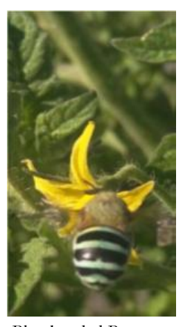
Blue-banded Bee

Family Apidae (pronounced: ay-pid-ee), includes Carpenter bees, Cuckoo bees, Blue-banded bees and Resin bees. Most Australian native bees are either subsocial or quasisocial. In subsocial species the females raise their brood to adulthood, then each new female goes out and on to nest build and raise her brood. Whilst in quasisocial species, the "mother" lays her eggs, provisions them with food, then leaves. After the brood emerges, young females share the nest for a few days, one will take over the nest to lay her eggs, while the rest go out to find their own nests. Females nest in hollows dug in ground, in branches or stems, or in wood or mortar. Roosting males grip branches with their jaws (mandibles), not their legs.