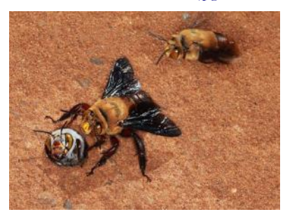
Dawson's Burrowing Bees (male waiting for emerging female).