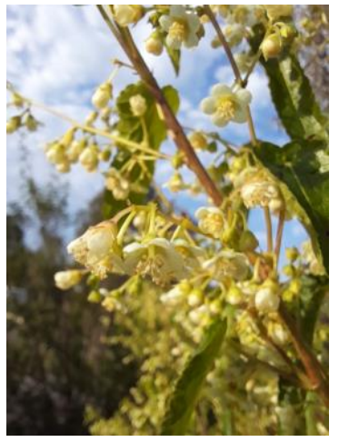
Gynatrix pulchella