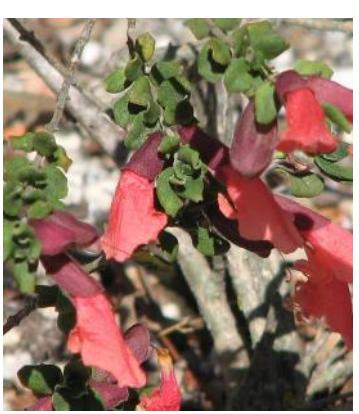
Prostanthera calycina