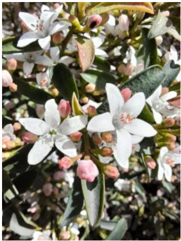
Philotheca myoporoides