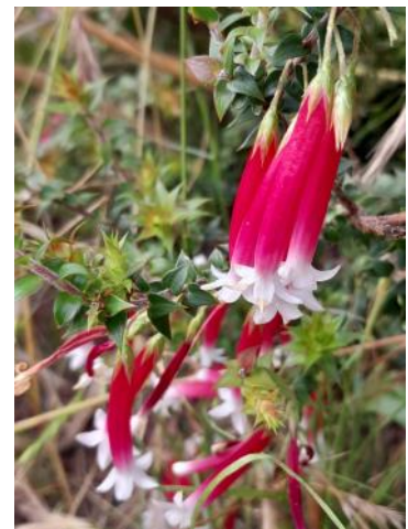
Epacris longiflora