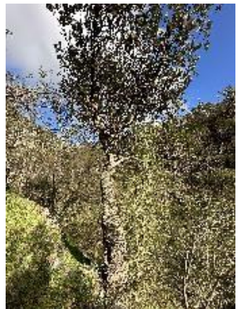
Banksia marginata on Mt Disappointment