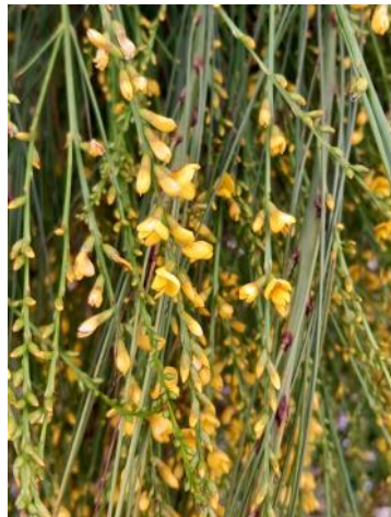
Viminaria juncea