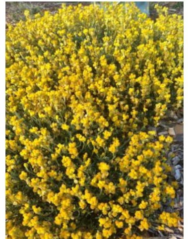
Chrysocephalum apiculatum