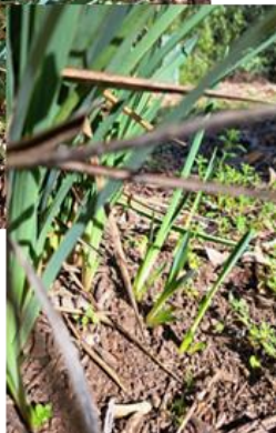
Dianella amoena form & leaves.

The current threats being the ongoing clearing of habitat and weed invasion. It is estimated that there only 1400 plants in about 120 locations. We've planted 10 18months ago, 4 in the garden and 6 in the paddock 2 of which didn't survive. The largest shown below reproducing very quickly with the ripening fruit taken by birds.