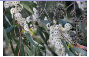
Eucalyptus radiata subsp. radiata

Epacris longiflora is an open spreading small shrub growing around 0.6m high with a spread up to 1m that is found naturally from eastern NSW to south-eastern QLD. There are three colour forms; pink & white, red & white, and all white. Flowers can occur most of the year and it flowers better with some moisture. Prefers shady moist