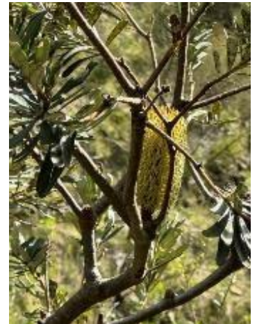
Banksia marginata flower spike