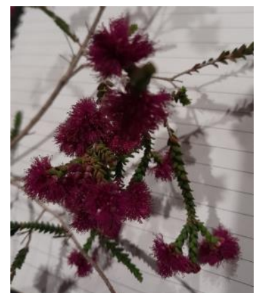
Beaufortia purpurea