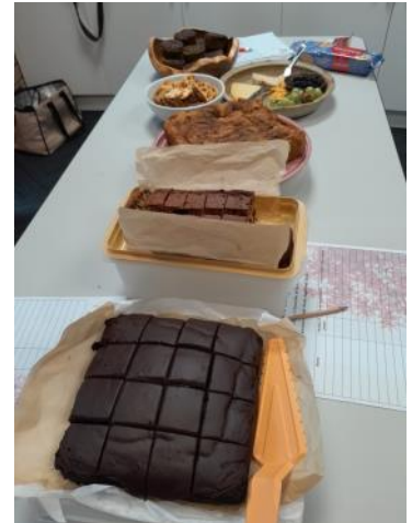
November meeting supper table.