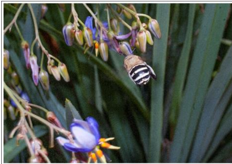
Dianella amoena & Blue-banded Bee

The commonly named the Matted Flax-Lily is an endangered, herbaceous, perennial plant endemic to Victoria. It has long grey-green leaves growing in clumps from an underground rhizome and has blue-purple flowers in spring-summer. It can grow up to 90cm in high, with its common name referring to its rhizomatous nature, forming large mats up to 5m wide. Its slender, grey-green leaves have a V-shaped cross section, having projections like teeth along the leaf midrib. It can reproduce vegetatively and by seed, displaying fragrant flowers with blue purple tepals and yellow stamens. Buzz pollination by native bees develops dark blue-purple fruits.