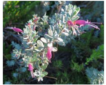
Eremophila glabra x veneta 'Augusta Storm'