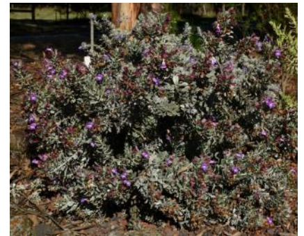
Eremophila spatulata

Remember: visitors, guests and friends are very welcome at APS Mitchell meetings. Doors open 7:15pm with main presentation from 7:30pm.