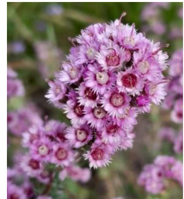
Verticordia plumosa