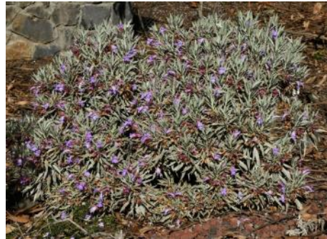
Eremophila phyllopoda x spatulata is a natural hybrid found in very small numbers where both parent plants grow together