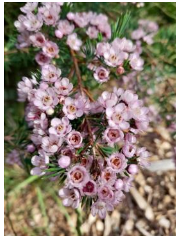
Verticordia x Chamelaucium