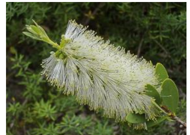
Callistemon citrinus White Anzac