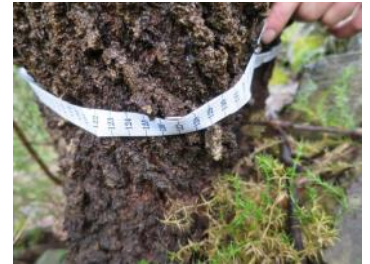
Banksia marginata measuring girth