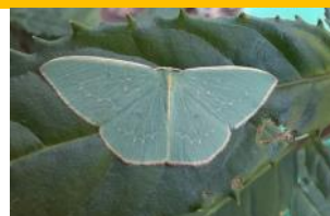
One of the Emerald Moths Chloroma sp. on Prostanthera lasianthos