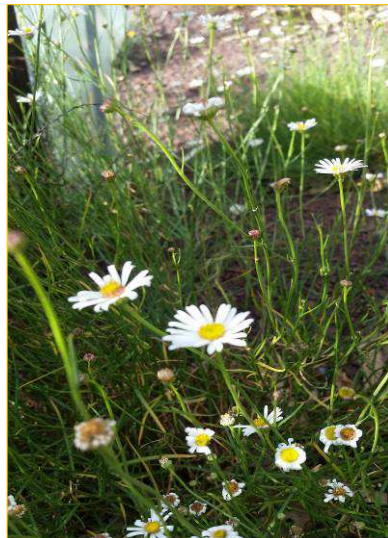
Brachyscome basaltica - Basalt Daisy

Information on other group ideas, activities, upcoming guests speakers and suggested guest speaker topics, can also be found in the March meeting report.