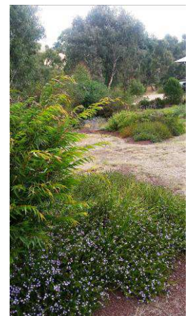
Foreground: Scaevola aemula Fairy Fan-flower (at Pyalong)

Feel free to BYO something to drink along with afternoon tea.